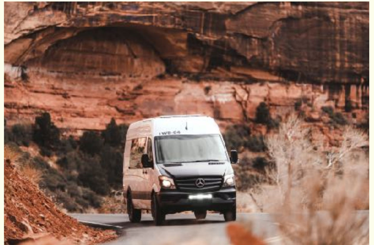
What The Pay it Forward Project would look like, in powerful energy vortex locations

Invest in humans , invest in mankind , invest in love and in a project that goes beyond self.